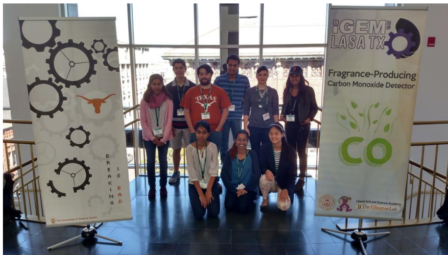
iGEM team at the Hynes Convention Center in Boston during the 2015 Jamboree